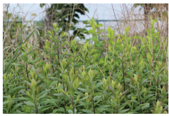
Solidago rugosa that has been planted in the Amelia Street School meadow.

As we move forward at VCU, we continue to look for opportunities to incorporate more native plants into our landscape and surrounding communities. Native plants contribute to a more biodiverse campus, and the reduced lawn and increased tree canopy help reduce runoff into the James River. New