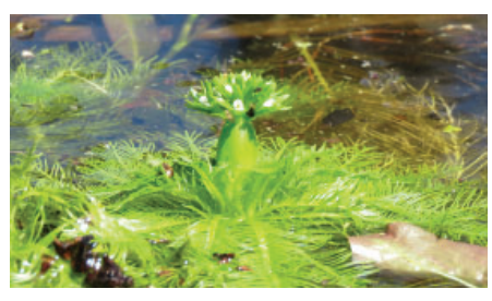
Featherfoil, Holtonia inflata