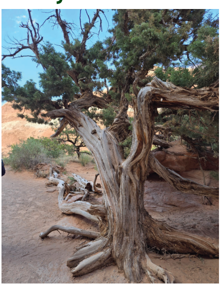
An ancient, gnarled conifer at Arches NP.

Our trip ended with a visit to the famed Arches National Park in Utah where timed admissions were required. As we had a couple of hours to kill before entering the park, we