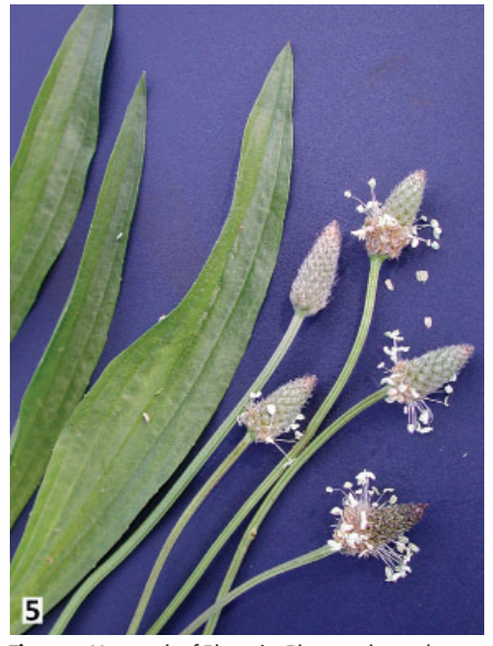
Figure 5. Narrow-leaf Plantain, Plantago lanceolata ; a species not native to North America, known to produce catalpol, and capable of supporting caterpillars of the Baltimore Checkerspot. (W. John Hayden)

For plants, there is never an upside to being eaten. Plants work hard to make sugars via photosynthesis and then use that sugar, along with water and minerals from the soil, to build their own bodies. Leaves, stems, roots, flowers, fruits, and seeds are all made by the plant starting with just sugar, water, and minerals from the soil. When an herbivore eats a leaf, the plant's investment of sugar,