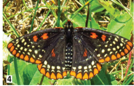
Figure 3 (top). Baltimore Checkerspot caterpillar, Euphydras phaeton; despite presence of catalpol, White Turtlehead is its primary food source.

Figure 4. Adult Baltimore Checkerspot butterfly; catalpol ingested as a larva makes this butterfly distasteful to birds.