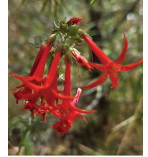
Desert Paintbrush, Larkspur, and Scarlet Gilia all seen in Black Canyon of the Gunnison National Park.

and western birds such as Stellar's Javs. As we headed toward Montrose and the Black Canyon of the Gunnison National Park, wildflowers appeared. I had never heard of this park and, apparently, it had been a national monument until 1999. What a delightfully underutilized national park! It was uncrowded, had gorgeous vistas, and supported loads of wildflowers. My favorites were Larkspurs and Lupines, Phlox, Desert Paintbrush, Arrowleaf Balsamroot, and so much more. It's truly amazing how many plants such dry climates can support.