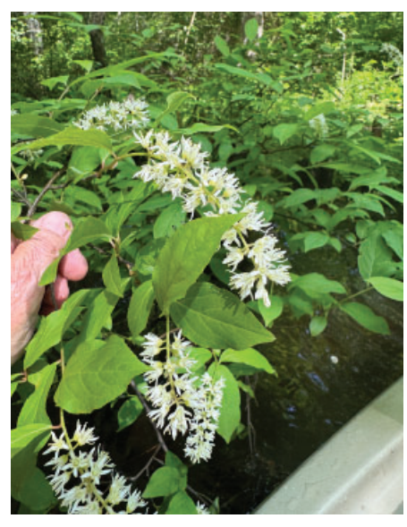
Virginia Sweetspire, Itea virginica