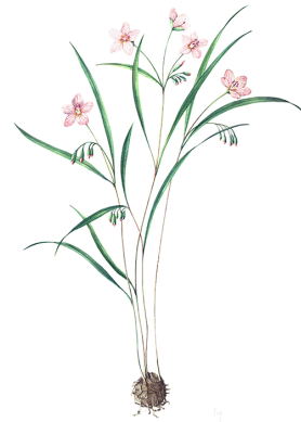
Spring Beauty Claytonia virginica