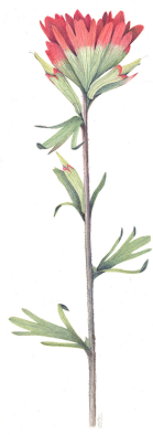
Rainbrush Castilleja coccinea