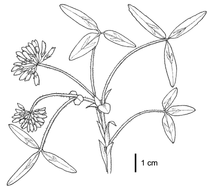
Trifolium virginicum Portion of plant, in flower