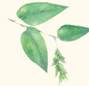
American Hornbeam Carpinus caroliniana