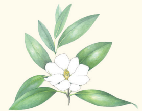
Sweet Bay Magnolia virginiana