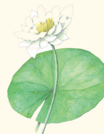
White Water-lily Nymphaea odorata