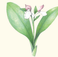
Showy Orchis Galearis spectabilis