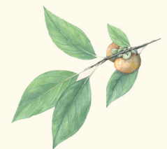
Common Persimmon Diospyros virginiana