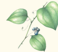
Common Greenbrier Smilax rotundifolia